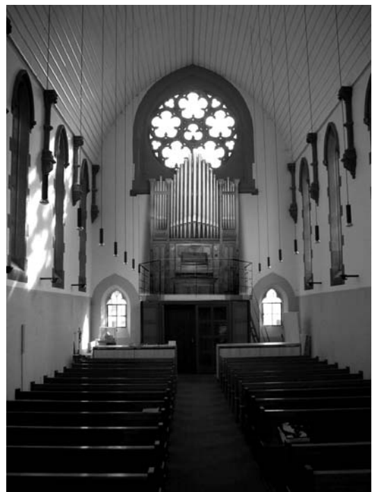
A vision of the future.